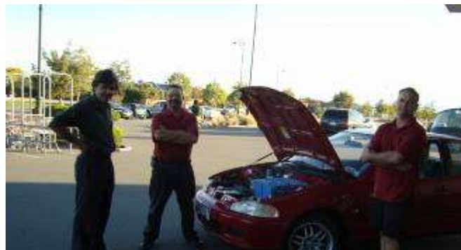
Electric car display by Voltmotive