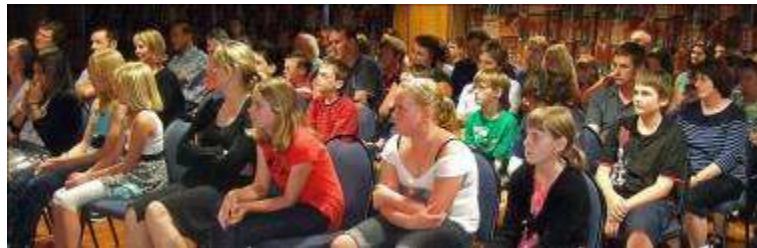
The audience at the Video competition presentations – well done Prebbleton School for their winning entry!

Lincoln, Prebbleton, Rolleston, Springston and Leeston "Envirotowns" worked together to provide events for the week leading up to Earth hour 2010. There were a number of events each day. Events were provided by the communities, Lincoln University, Landcare Research, local libraries, local businesses as well as the SDC – this was a great example of bringing people together for a common cause.