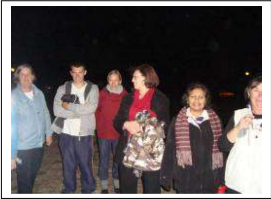
Earth Hour Torch light walk in Rolleston. Prebbleton also had a torch light walk, starting with a picnic and followed by refreshments

Earth Hour – candle lit barn dance. Turn off your lights and appliances – come and share the power – and have fun! – and they came in droves – and had fun! All ages from 3 – 83.