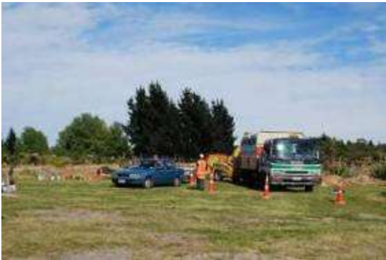
Prebbleton's Mulcher Morning

The local school is on the way to becoming an Enviroschool with an active enviro team (and they won the Earth Hour video competition!). A community cottage will provide a place where locals can come to obtain information about community groups and events.